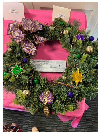
Nancy’s wreath won a blue ribbon at the Spring conference.