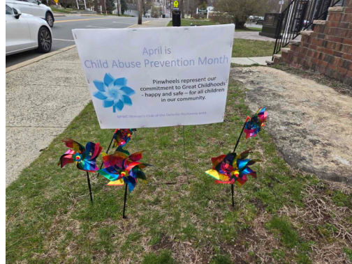
Rockaway Borough Public Library