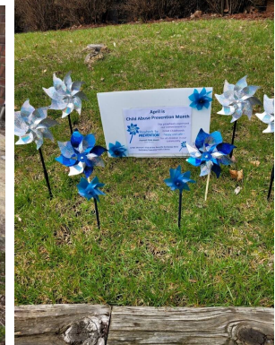
Rockaway Township Public Library

April 8 th – Monday -7:00 PM -Eve Meeting- Denville Community Church