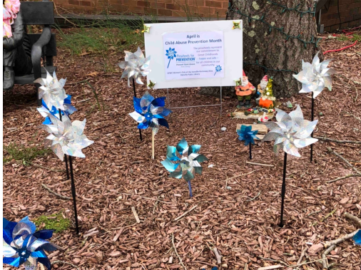
Denville Public Library